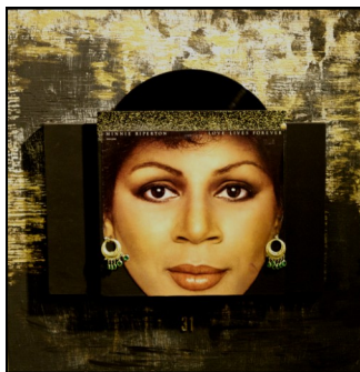
Minnie Riperton, (31)