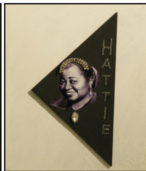
Hattie McDaniel, (57)

Ancestral Shrine in Honor of the Women Memorialized in Clock Strikes Thirteen