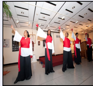
One Accord Dance Ministry of the Bethel Gospel Assembly