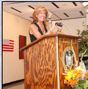
Hoda Kotb, Award Winning Broadcast Journalist

Dateline NBC. Kotb, a breast cancer survivor was keynote speaker for the event and shared her strength regarding