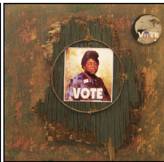
Fannie Lou Hamer, (59)