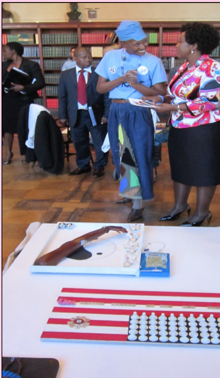
Wilhelmina greets Madame Zuma, First Lady of South Africa.

T he artistic journey continues and SISTA AH's artistic endeavors have expanded to include the celebration of awareness and survivorship in the international arena. In September 2011 The International Diabetes Federation recruited ten artists who converged on the library at The New York Academy of Medicine to create 8' x 10' murals to bring world wide awareness and increase funding for four non-communicable diseases: diabetes, lung disease, cardiovascular disease and cancer.