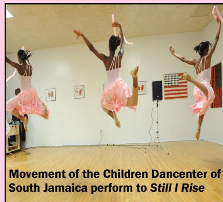
Movement of the Children Dancer of South Jamaica perform to Still I Rise