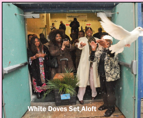
White Doves Set Aloft